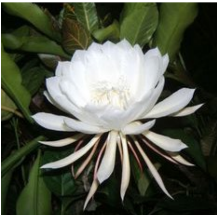
The Brahma-Kamal blooms only at night.