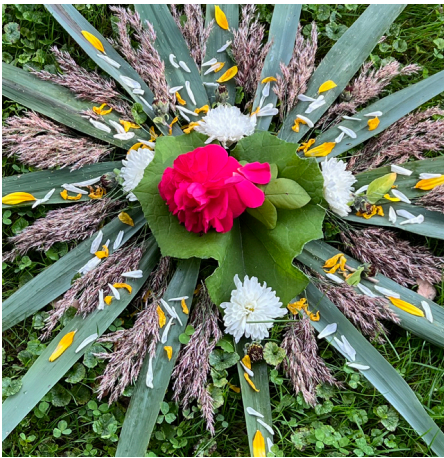
Morning Altar Jill Greenbaum

Over the past year, my subjects of introspection and subsequent altar construction have included: Releasing and Readying, Many Conversations/ Listening for Other Voices/Perspectives, Becoming/Unfolding, Transforming a Gift, Letting Go, and Crossing a Threshold. My altars are created indoors or outdoors, in 15 minutes or 60, using materials ranging from all nature-based (branches, leaves, flowers, berries, shells, bark, ashes, and more) to the inclusion of my artwork and art materials, and from sizes that fit in my palm to others with a four-foot diameter.